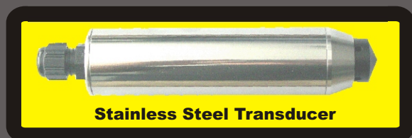
Stainless Steel Transducer

The TM8 software supplied with the instrument can be run on a PC or PDA device to provide a display of current values together with a recent tide curve history over the previous 48 hours. The software includes a timeout function to prevent the display of tide data more than 1 minute old.